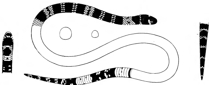
FIG. 34. Type of Micrurus elegans Jan (from Icon. Gen. Ophidiens, Livr. 42, pl. 5, fig. 2).

there is a series of white scales arranged like a necklace of pearls; behind this there is a large black triangular marking, followed by a light band (red), extending for three or four scale-lengths, in which the tips of the scales are black. From this point there are thirteen or fourteen groups of triple black bands [triads], which tend to be confluent beneath, each [individual] band extending over three or four scales and separated from each other by a single series of white scales [really by a double series, cf. plate]. The spaces between the triads are 4 scales long, and there are large black spots in these [red] bands on the ventral surface. The tail is black, with six white rings formed by a single series of scales.